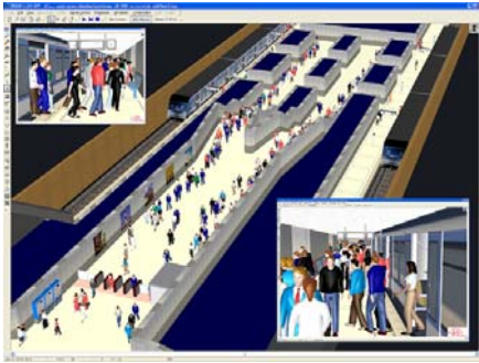
(Ped_Underground03-116_combined_sharp.tif) Pedestrian simulation including interaction between vehicles and passengers